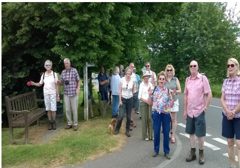
Walkers from Membury gather today on the annual parish walk